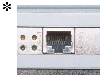
* Plug your ethernet cable in here for the internet.